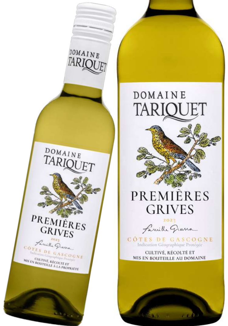
37,5 cl half-bottle